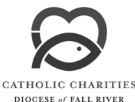
CATHOLIC CHARITIES DIOCESE OF FALL RIVER

Whatsoever You Do to support the Catholic Charities Appeal provides help to families through adoption counseling, individual and family counseling, citizenship preparation and ESL classes. Thank you to all parishioners who have supported the Appeal with a donation or pledge. A total of $29,979 has been donated or pledged to date. The Catholic Social Services 2016 Annual Report is available in the Rectory if you'd like to see how your donations are used.